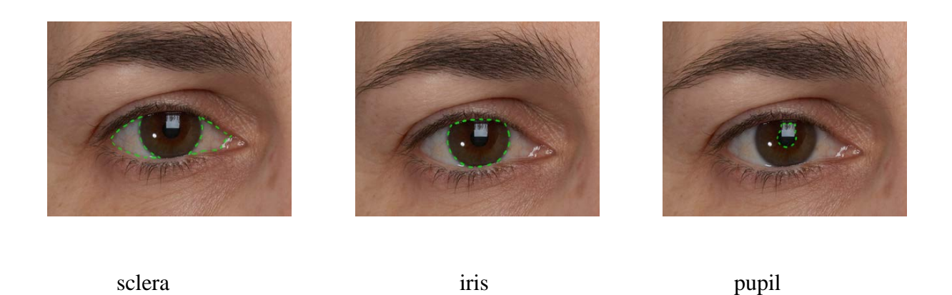
Figure 1 . Labelling of eye regions. Dashed lines show how the eye regions were labeled. Subsequent processing removed the pupil and specular reflections from the iris region.